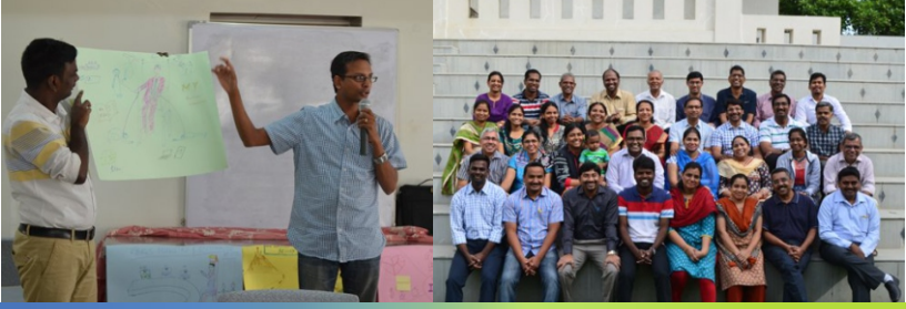
TRAINING OF TRAINERS SESSION HYDERABAD

It was an intense three days of reaffirming, renewing and being refreshed as disciples of Christ and a real encounter with God. We must mention it was also a lovely time to fellowship, meet old