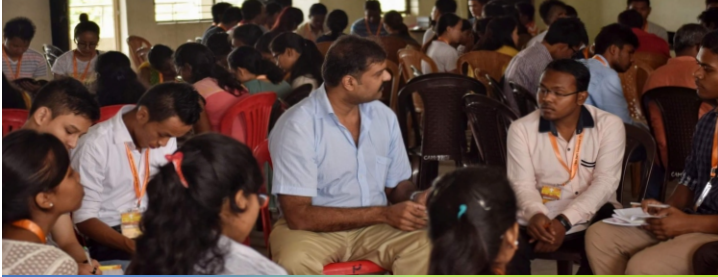
NORTH INDIA REGIONAL CONFERENCE - 2016