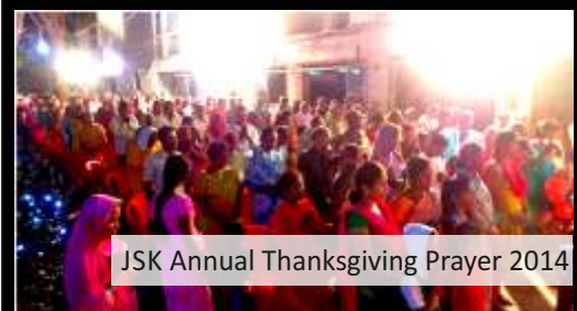
JSK Annual Thanksgiving Prayer 2014