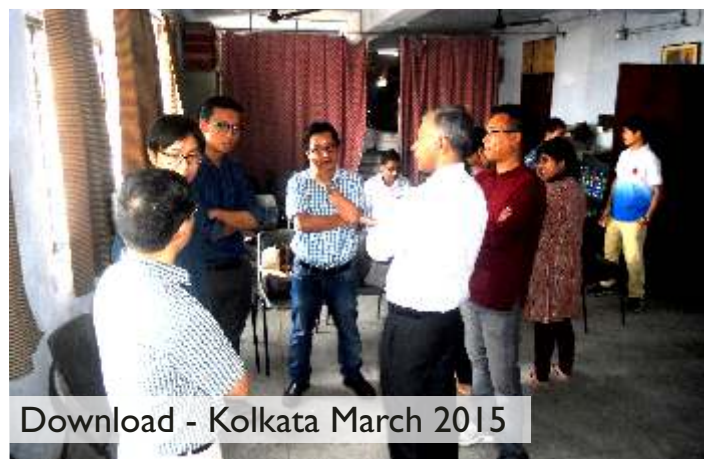
Download - Kolkata March 2015