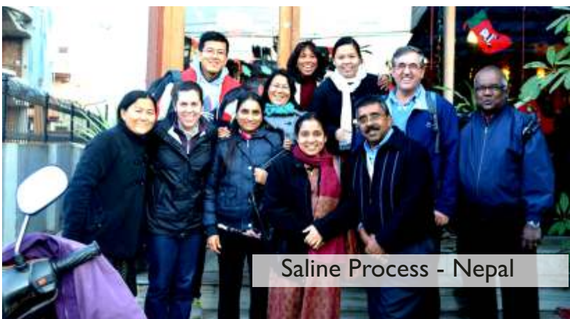
Saline Process - Nepal