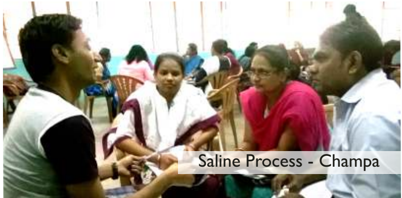
Saline Process - Champa