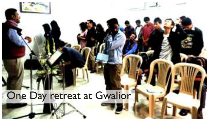
One Day retreat at Gwalior