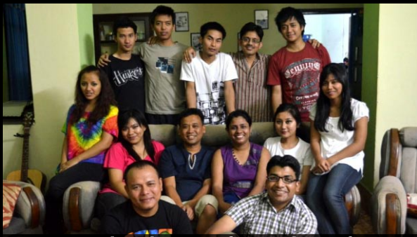
Weekend retreat for medicos of West Bengal at TLM Hospital, Purulia