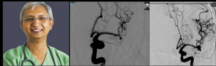
A case of Middle Cerebral artery Aneurysm treated by Coiling